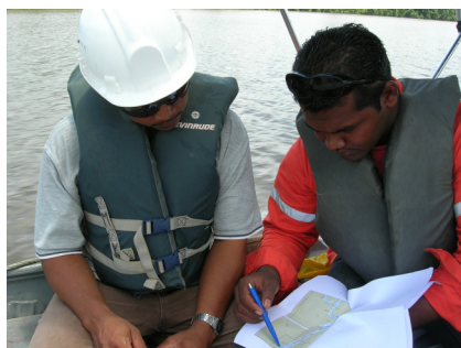
Checking measurement locations