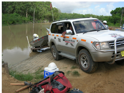
Launching the boat